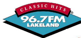
80's, 90's and Now